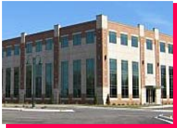
4600 W. Loomis Road Greenfield, WI